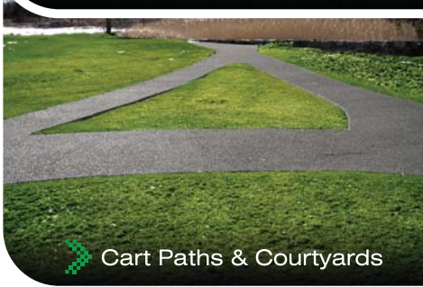
Cart Paths & Courtyards

High Porosity | Limited Maintenance | Load Bearing