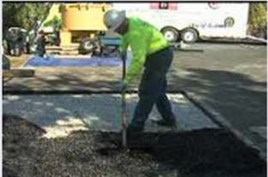
A city worker lays Flexi-Pave in a parking lot in downtown Dunedin.

Post a comment | E-mail this story | Print